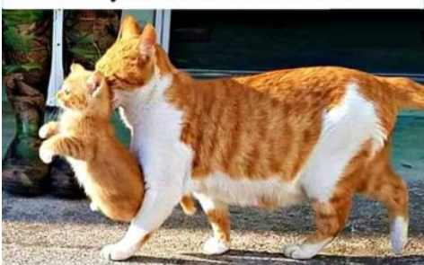
What part of "STAY AT HOME" did you not understand?