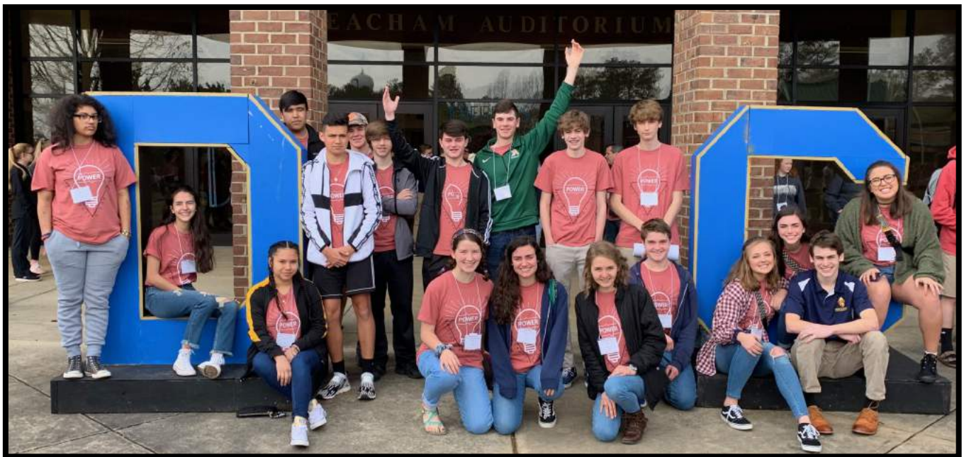
Youth at the Diocesan Youth Conference March 9