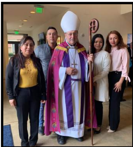
Rite of Election At Our Lady of the Lake Chapin, SC March 9